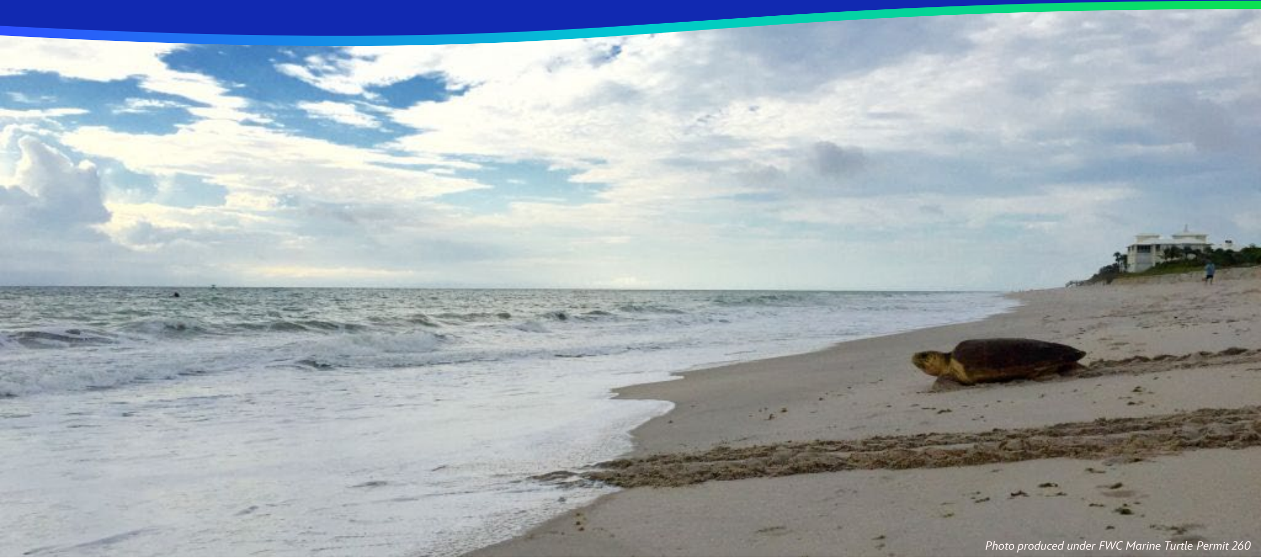
Photo produced under FWC Marine Turtle Permit 260