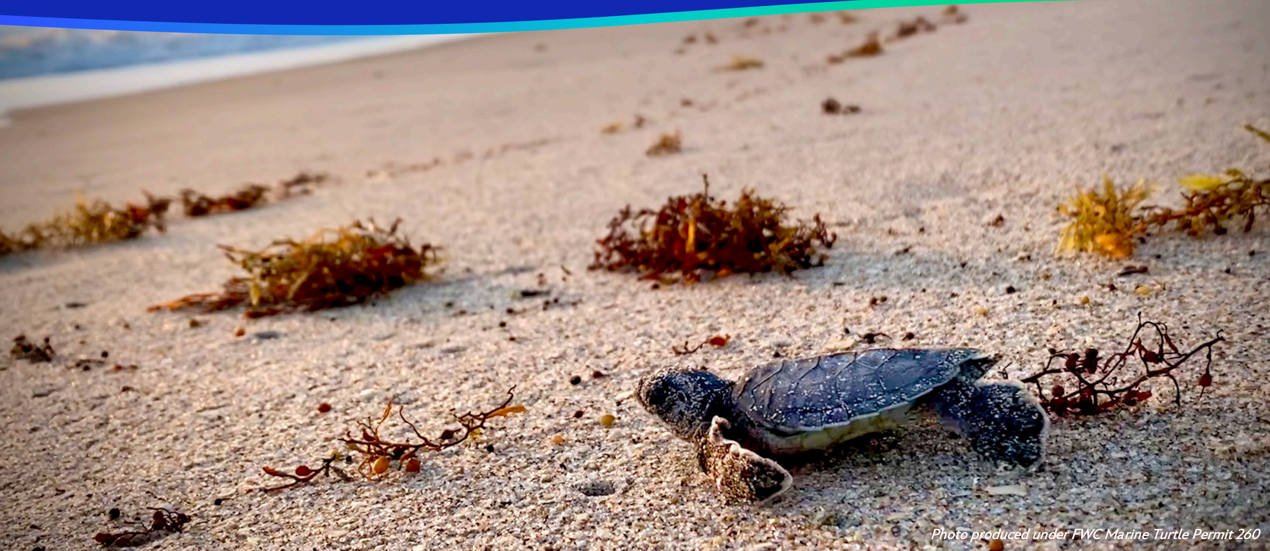
Photo produced under FWC Marine Turtle Permit 260